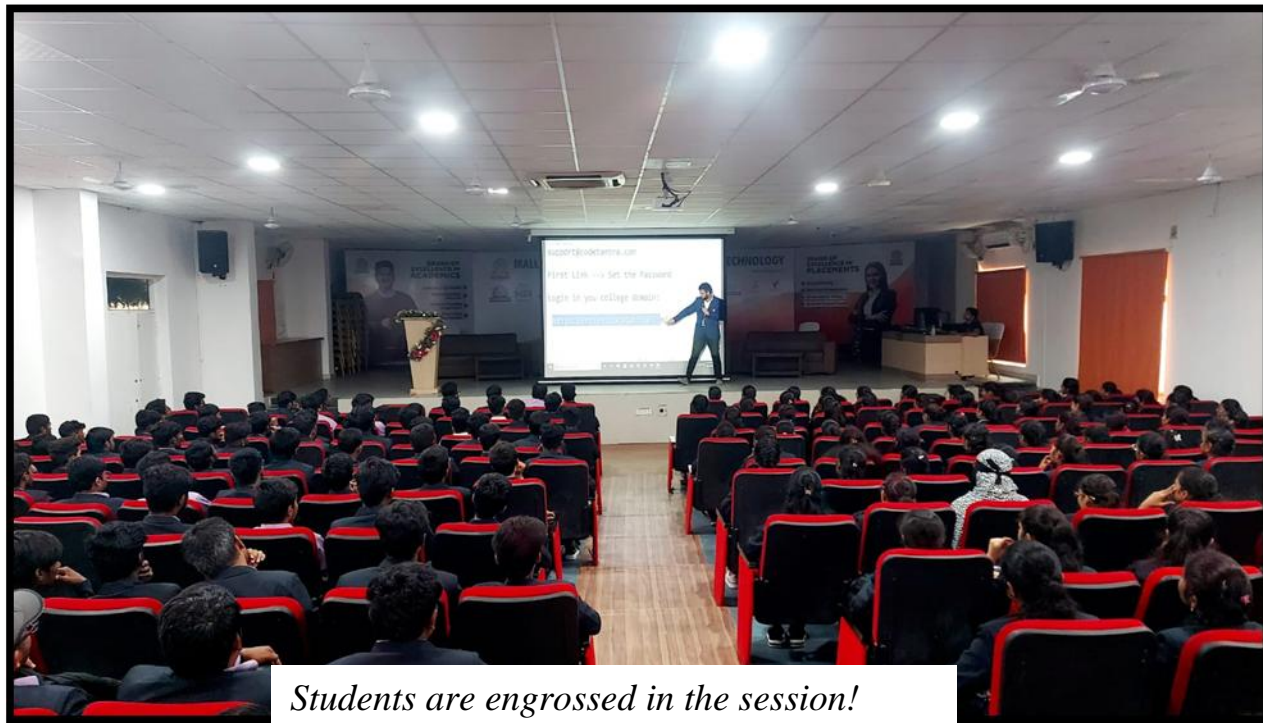
Students are engrossed in the session!

The programme was conducted in the placement block on 1 st October, 2024.