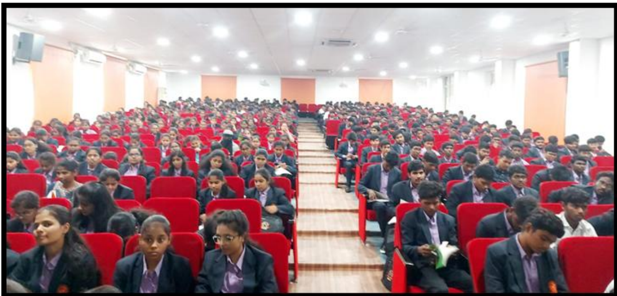
Taking notes from the CodeTantra trainer