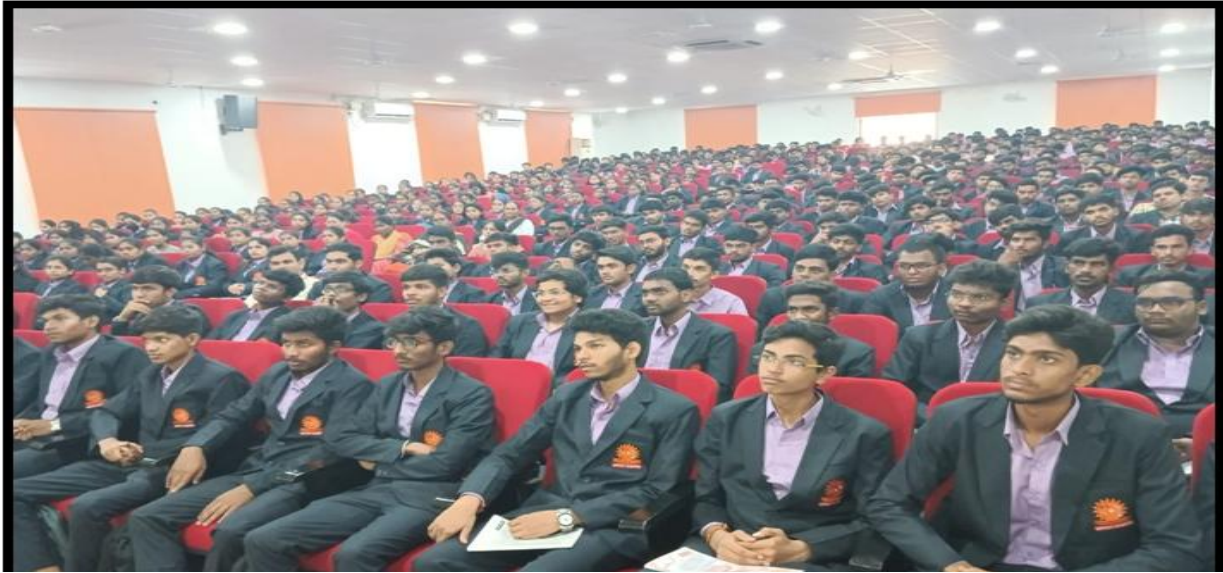
The novice professionals are all geared up for the programme in their professional attires!

Code Tantra is more than just a coding course; it's a holistic approach to learning how to code. It will help the first year B.Tech students become not just coders, but creators who understand the deeper connections between technology and human experience.